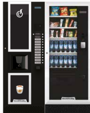
LEI400 + ARIA M MASTER

LEI400, automatic vending machine for hot drinks with 400 cups capacity.